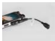
(4) OTG data Transmit