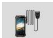
(1) Infrared Camera

TA-HHT is a handheld terminal specially designed by Tespro China for on-site measurement data collection. The terminal adopts a high-strength outdoor protection shell design, with an IP68 waterproof rating, and can adapt to any harsh outdoor environment. At the same time, using the standard Android operating system can provide a very user-friendly operating experience, while also providing a standardized software development environment. HHT can be used in conjunction with TP-USB and TP-BT series optical probe for meter data reading. If needed, standard meter reading software such as IEC and ANSI can be configured to provide customers with one-stop services. TA-HHT reading data supports direct submission to SEMS-SaaS for management, forming a complete solution. TA-HHT is designed specifically for metering data reading and accepts OEM/ODM.