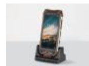
(6) Desk Charge